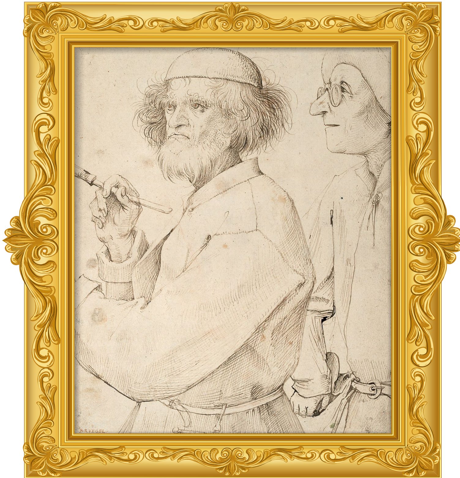
"The Painter and The Buyer", 1565. Pen and black ink on brown paper, 255 x 215 mm Graphische Sammlung Albertina, Vienna. This is thought to be a self portrait of Pieter Bruegel, the Elder.

Pieter Bruegel (the Elder) had two sons who also became painters: Pieter (the younger) and Jan.