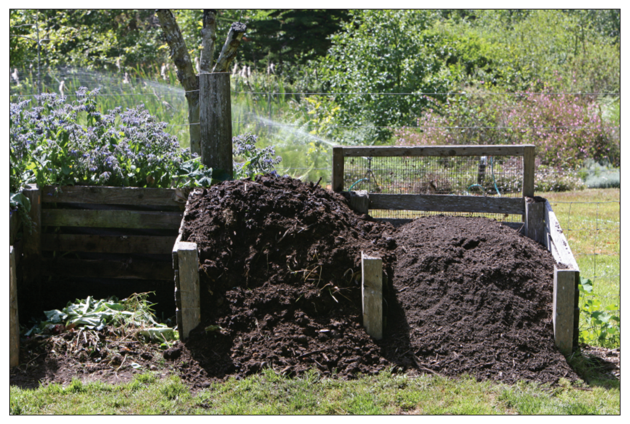
You can build a frame from recycled wood on top of the soil.