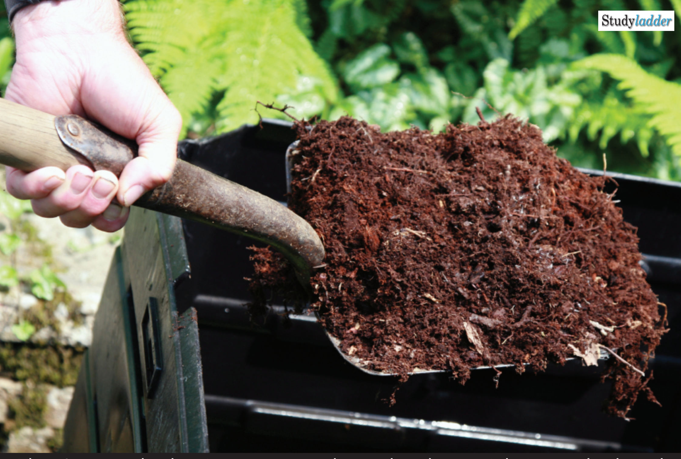
There's no need to buy it, compost can be made at home, right in your back yard.