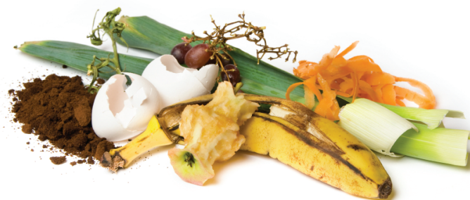
vegetable peelings, egg shell, coffee grounds