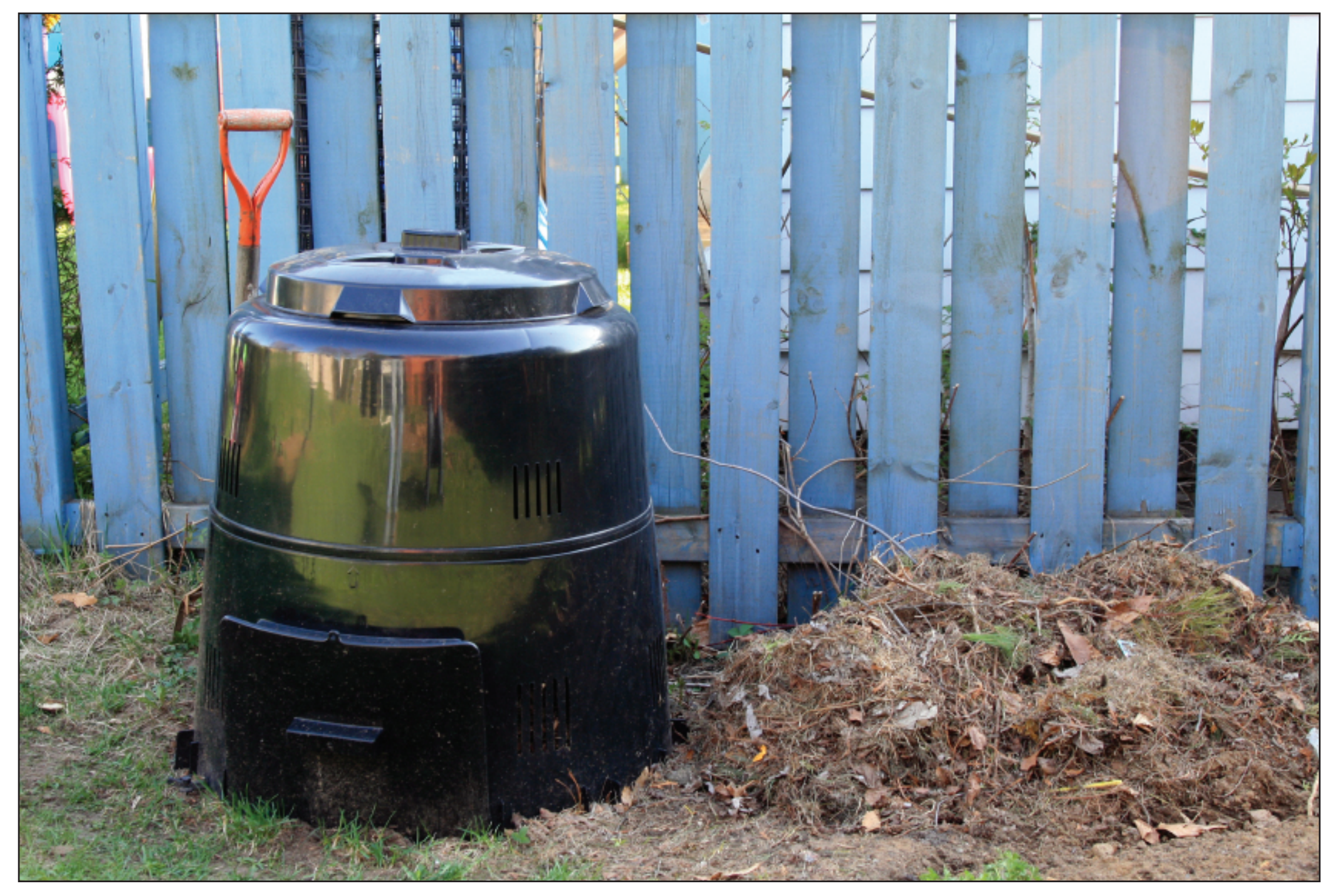
Or you could buy a plastic composting bin with a lid.