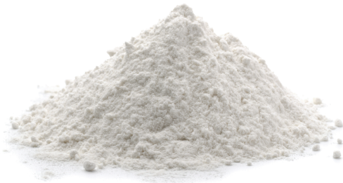
soda ash (calcium carbonate)