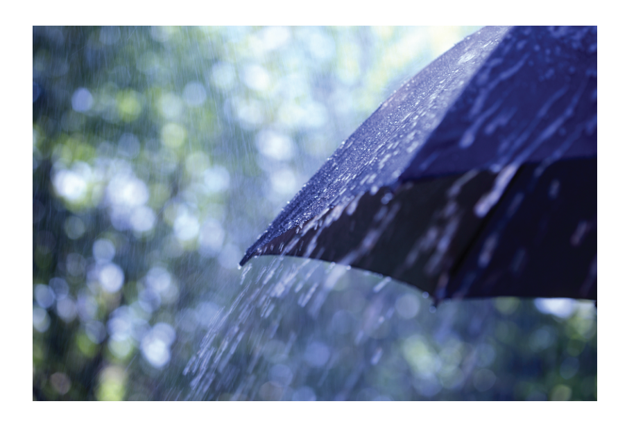
The rain fell ______.