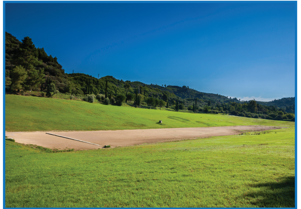
This is the stadion track at Olympia, where the stadion race took place.

It would have been a great honour to win the race at the Festival of Zeus!