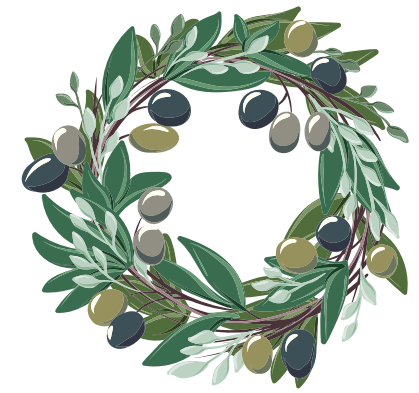
Winners received an olive leaf crown as a symbol of their success.

In 684 BCE, the games were extended to three days to allow for more events. Then, in 472 BCE, the games were extended to 5 days. The Olympic Games included the following events: