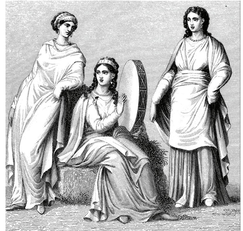
Only freeborn Greek men were allowed to compete in the games. Slaves and women were not allowed to attend the games or compete in them.

Ancient pottery was highly decorated. It depicted many of the competitions that were held at the time.